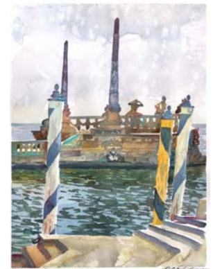
Vizcaya Venetian Barge, Miami